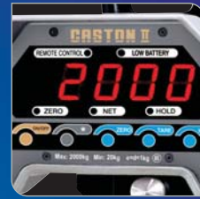
1.2" LED display